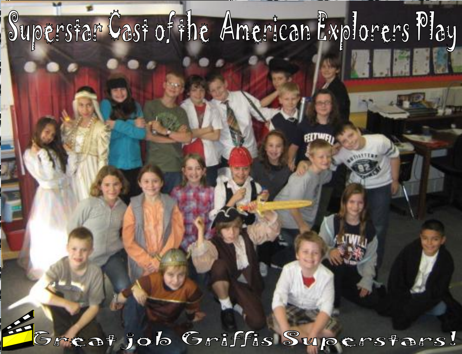
Great job Griffis Superstars!