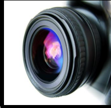
Professional Photographer (Abbie's Grandpa)