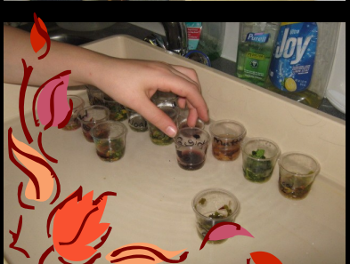
Colors of Fall Experiment