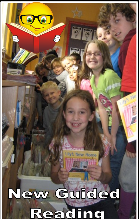
New Guided Reading Books