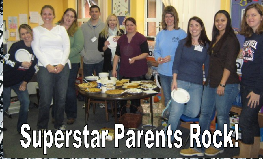
Superstar Parents Rock!