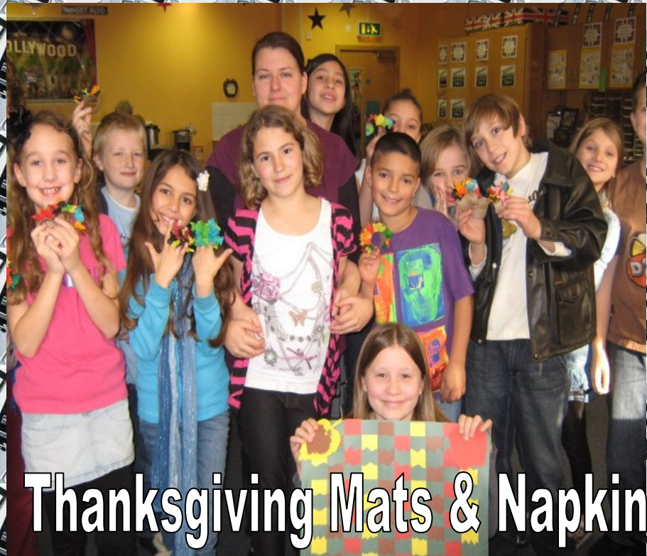
Thanksgiving Mats & Napkin Rings